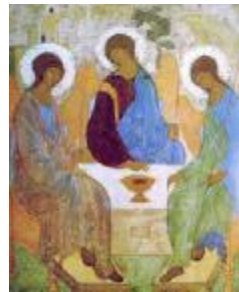
ICON OF THE HOLY TRINITY By Andrew Rublev, AD1425