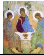
ICON OF THE HOLY TRINITY By Andrew Rublev, AD1425